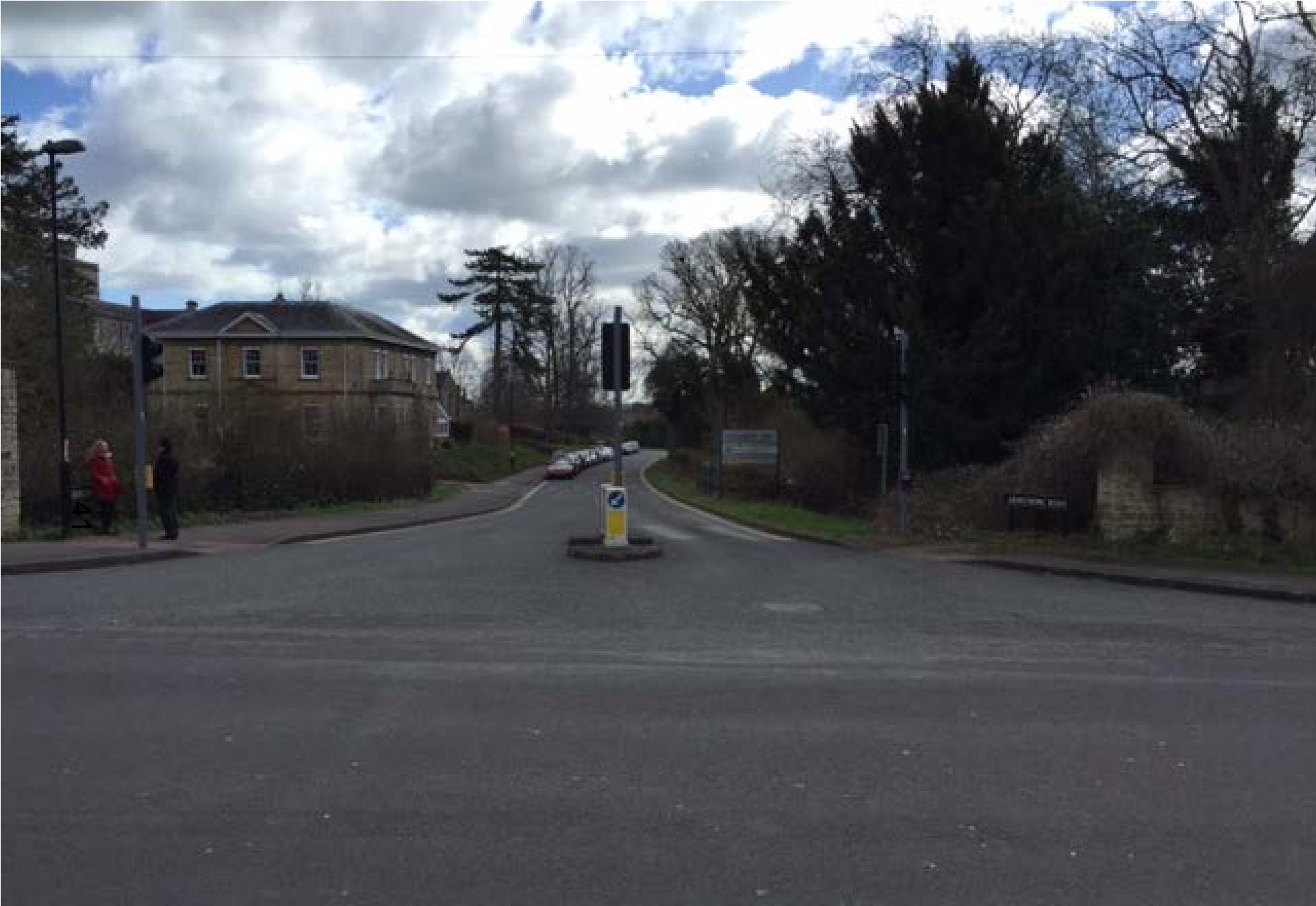
Armstrong Road / Sandford Road Junction